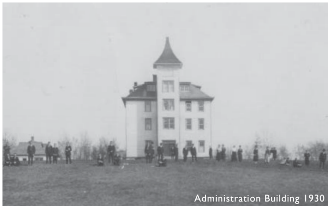
Administration Building 1930

Western Canada experienced unprecedented growth during the first decade of the 20th century. Immigrants from Europe, the eastern provinces, and the United States followed the railroads westward. The growing population made it necessary to organize the territory into provinces. Alberta gained its provincial status in 1905 and two years later a group of Seventh-day Adventist laypersons and church leaders established a school for their youth near Leduc, Alberta. Burman University traces its roots to this first Alberta Seventh-day Adventist secondary school.